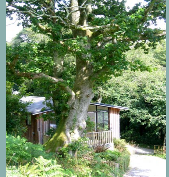
Front cover image: Blackpool Sands